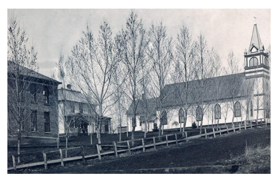
St. Mary's Church and St. Joseph's school, c.1910