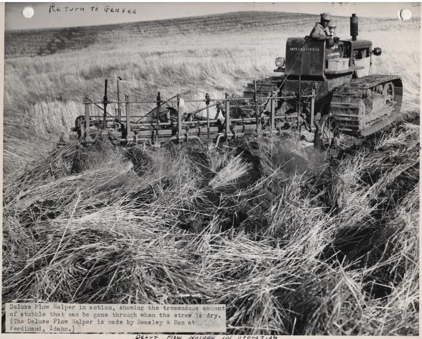
Deluxe Flow Helper in action, showing the tremendous amount of stubble that can be gone through when the straw is dry. (The Deluxe Flow Helper is made by Beasley & Son at Ferdinand, Idaho.)